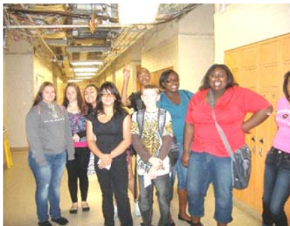
Academy Park High School