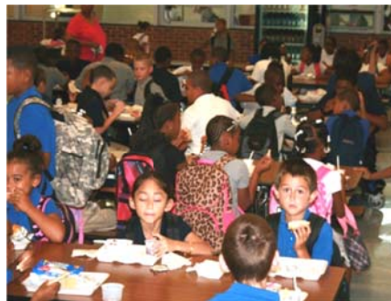
Darby Township School