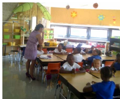
Sharon Hill School