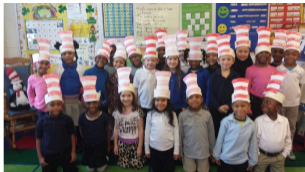
Kindergarten students celebrate Dr. Seuss' Birthday

Kid Writing is an essential part of the Kindergarten Center curriculum. Teachers focus on this writing skill during the first month of school. It is amazing to see the growth that students have made throughout the school year. Many students have gone from writing only letters and simple pictures to multiple sentences and detailed illustrations. It is wonderful to see what independent writers our students have become!